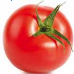
2D relative abundance plot of sulfur on a tomato