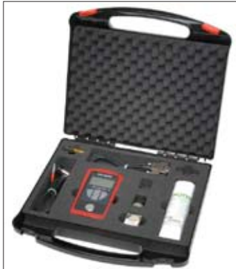
Delivery in a handy carrying case