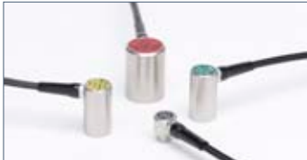
For any measurement: The probes of the ECHOMETER 1076 TC