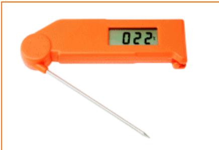
Elcometer 212 Digital Pocket Thermometer with Needle Probe

Designed to cope with routine day to day use, the Elcometer 212 is the gauge to take fast, accurate measurements. Incorporating an auto-power on/off facility, by simply unfolding and folding the probe, the instrument switches on and off.