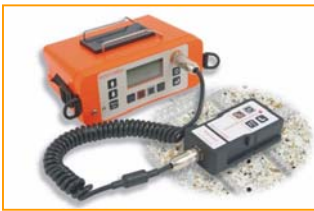
Elcometer 331 2 B Covermeter

The gauges store up to 240,000 cover and Half-Cell readings side by side in their extensive memories. Available in models SH and TH, the Elcometer 331 2 Covermeter with Half-Cell is perhaps the most versatile and cost effective Covermeter on the market today.