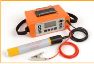
Elcometer 331 2 with Half-Cell & memory

Elcometer 331 2 Covermeters with Half-Cell allow users to not only identify the location, orientation, depth and diameter of rebar, but also the potential for corrosion all in one easy-to-use gauge.