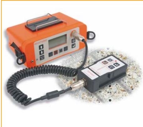
Elcometer 331 2 Covermeter with Half-Cell

This easy to use gauge not only quickly and accurately identifies the location, orientation, depth and diameter of rebar, but also the potential for corrosion.