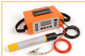
Elcometer 331 2 with Half-Cell & memorv

Elcometer 331 2 Covermeters with Half-Cell allow users to not only identify the location, orientation, depth and diameter of stainless steel rebar, but also the potential for corrosion all in one easy-to-use gauge.