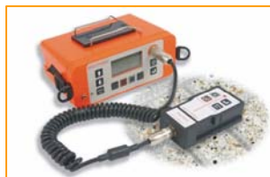
Elcometer 331 2 B Covermeter

The gauges store up to 240,000 cover and Half-Cell readings side by side in their extensive memories. Available in models SH and TH, the Elcometer 331 2 Covermeter with Half-Cell is perhaps the most versatile and cost effective Covermeter on the market today.