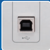
Data exchange via USB interface

By means of extremely short flash impulses the HELIO-STROB master allows the observation of very rapid processes with the naked eye. It provides pin sharp images of the apparently stationary object: the "stroboscopic effect". All functional adjustments can comfortably be set via the touch panel and the twist knob. When analysing fast processes such as rotation or vibration the standard features "slow motion" and "position" (phase shifting) put even the smallest detail into perspective. The finely graduated dimmer function allows an adjustment of the light intensity and thus enables fatigue-free observation to the smallest detail. The flash frequency can either be controlled by the accurate internal trigger, by an external trigger or even by mains synchronous triggering. Thanks to the integrated prescaler external impulses are processed up to a frequency of 8000 Hz*.