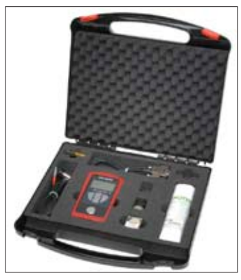
Delivery in a handy carrying case