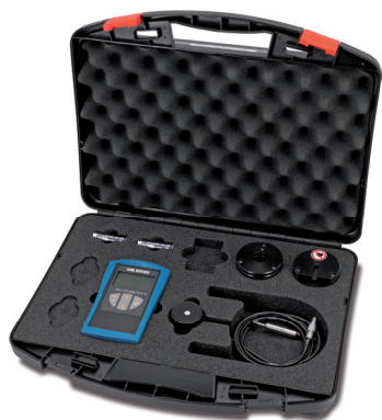
Supplied in a handy carrying case (example picture)

The DEUTROMETER makes it possible to measure field strengths and monitor limit values easily and conveniently. With a special probe, it is also possible to measure UV and white light.