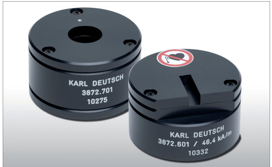
Zero field chamber (left) with field-free inner space and reference magnet with defined field strength are accessories for field strength measurement and used for checking the gauge