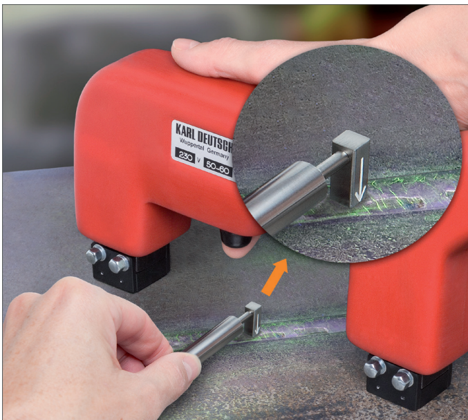
Probe for narrow geometries with transverse fields