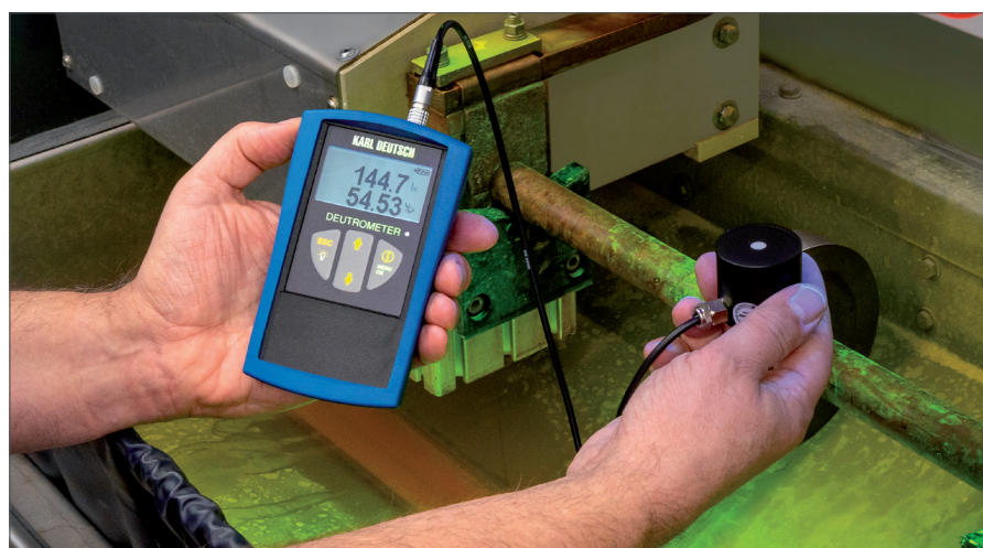
To control the viewing conditions, the DEUTROMETER together with the DEUTROLIGHT probe simultaneously provide the measured values for the residual daylight and the UV intensity