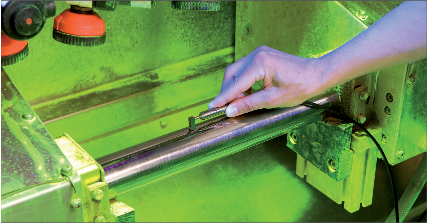
Application example: Tangential field measurement using the 90° probe with field flow

er the workplace is sufficiently darkened and the UV intensity is strong enough. According to the standard, existing white light portions of the UV source used must also be taken into account for measurement. According to EN ISO 3059, \leq 20 lx for the white light portion and