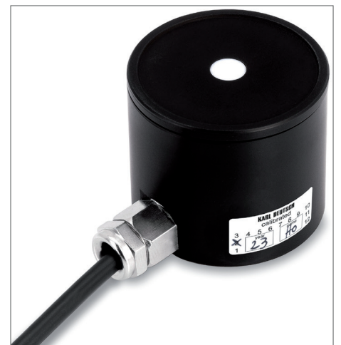
UV and white light probe with translucent diffuser through which the light reaches the measuring unit in the probe